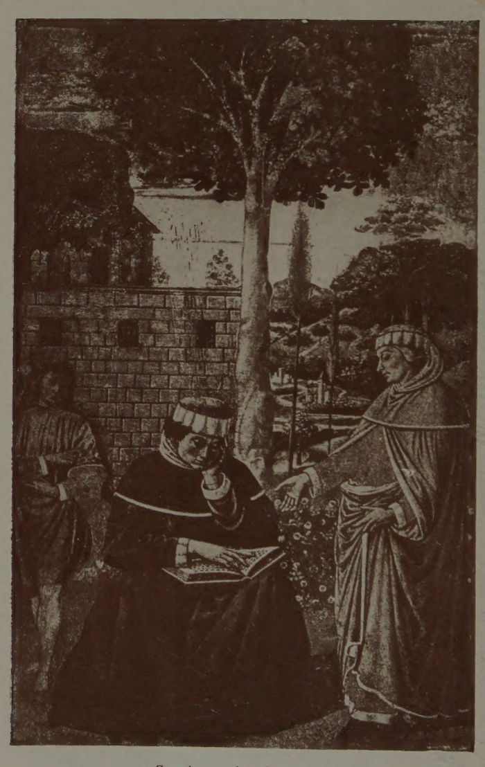
St. Augustine Reading From a fresco by Benozzo Gozzoli